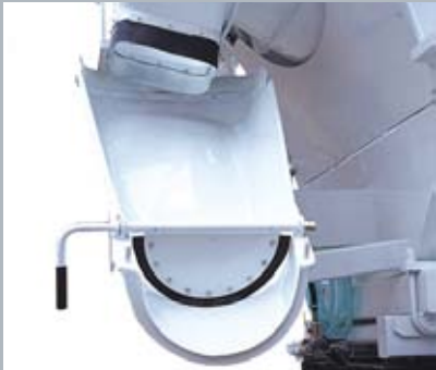
Concrete Baffle at Discharging Chute